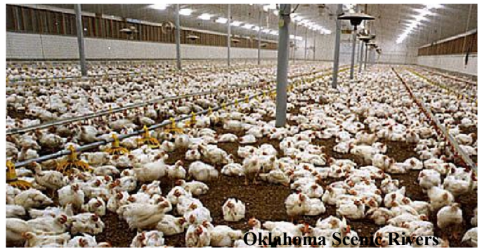
Oklahoma Scenic Rivers

What's threatening it: Water quality in Lake Tenkiller and the Illinois River in Oklahoma is threatened by increasing phosphorus, sediment, and bacteria pollution from human populations, confined animal feeding operations, and soil erosion associated with intensive agriculture and development. These pollutants to the river and its many tributaries trigger algal blooms in streams and lakes; degrade spawning, nursery, and foraging conditions for native fish, including game fish and their food sources; and generally reduce the quality of the fish and the fishing experience. They also impair drinking water quality and raise the cost of drinking water treatment. Ultimately, these pollutants collect in Lake Tenkiller, threatening an important ecological and economic resource for the region.