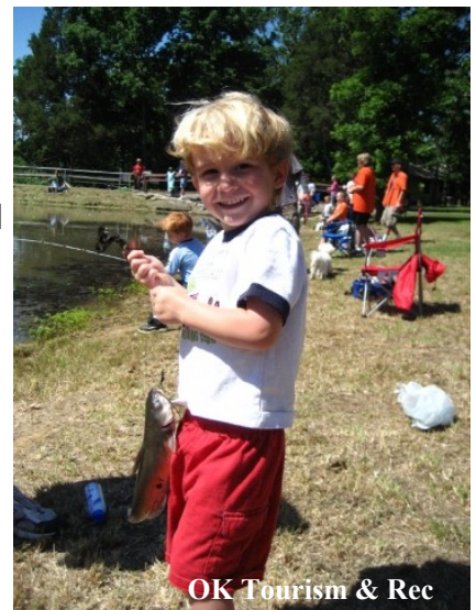
OK Tourism & Rec

What would fix the problem: The key is to reduce the phosphorus pollution entering Grand